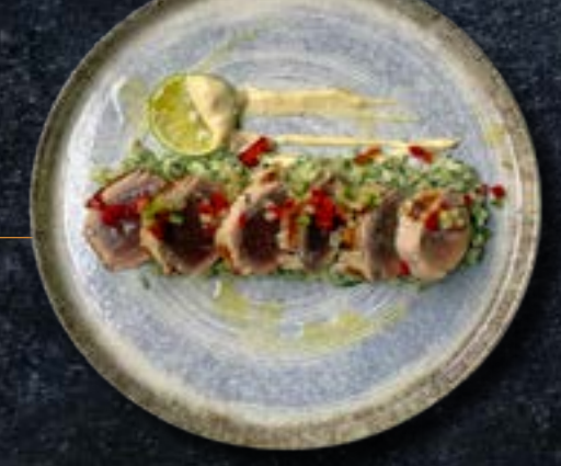
TUNA STEAK with mix of salads, nuts and appl