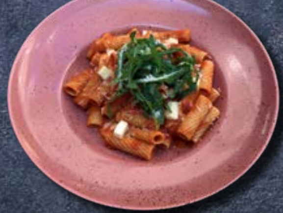
RIGATONI BISTECCA *beef, olives, sun-dried tomatoes, peperoncino, tomatoes, mozzarella